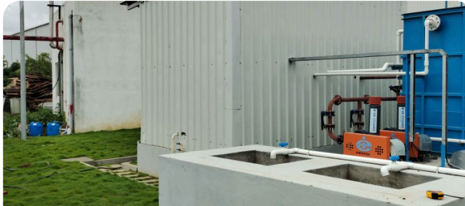
Howden Air & Gas Industrial Project