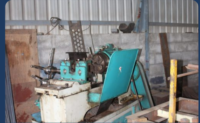
Round Bar Threading Machine

Precision cutting for complex profiles & gusset plates