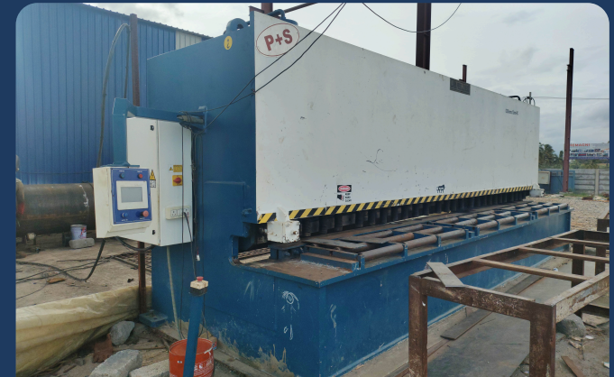
6300mm Shearing Machine

In-house roll forming for custom-length roofing sheets