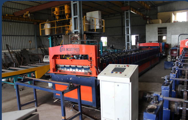
Roof Sheet Forming Machine

Punching, shearing, notching & bending in one unit