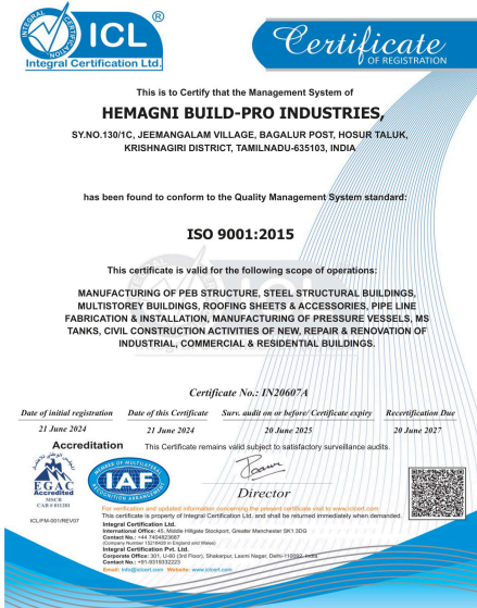
ISO 9001:2015 Quality Management System