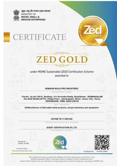
ZED Gold Certified Ministry of MSME