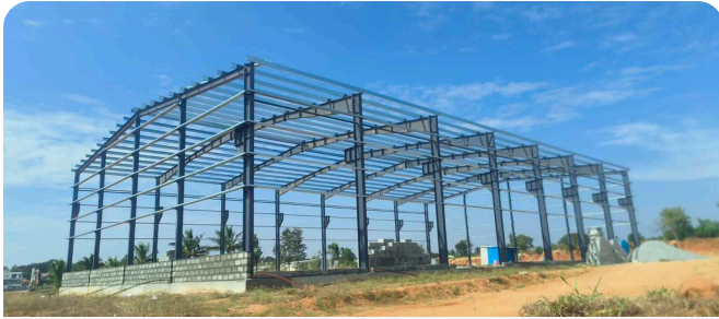
Anjay Reddy Site Industrial PEB, Eluvapalli