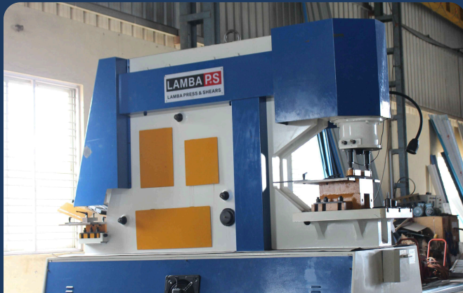
Multifunctional Iron Worker

Anchor bolts & tie rods for foundation connections