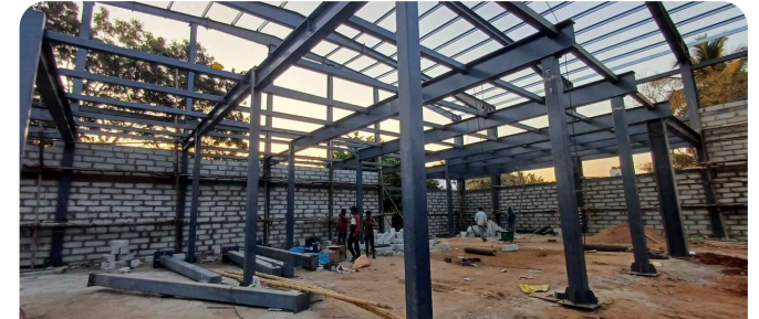
MSPL Bowling Hospet