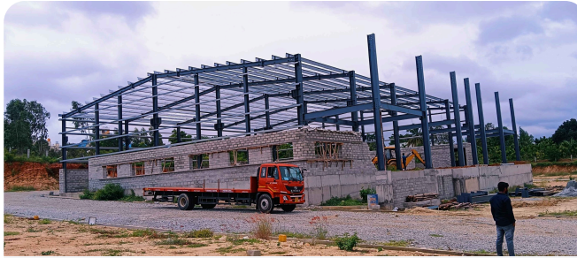
Dev Components Pvt Ltd Industrial Facility