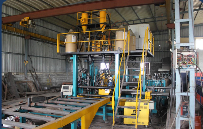
Auto Beam Welding Machine

Production Capacity: 15 MT/day | 400 MT/month