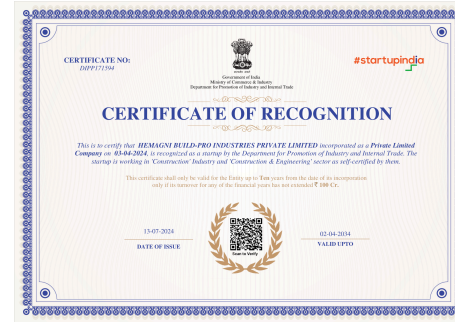
Startup India DPIIT Recognition