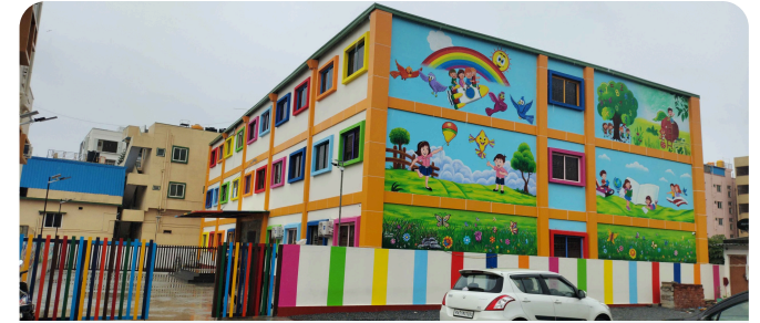
Sunshine Smart School Electronic City, Bangalore