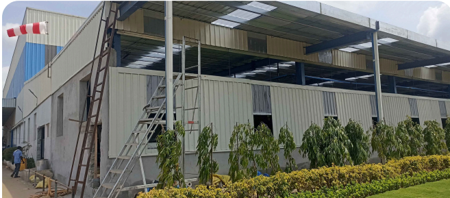
Indo Autotech Ltd Automotive Industry