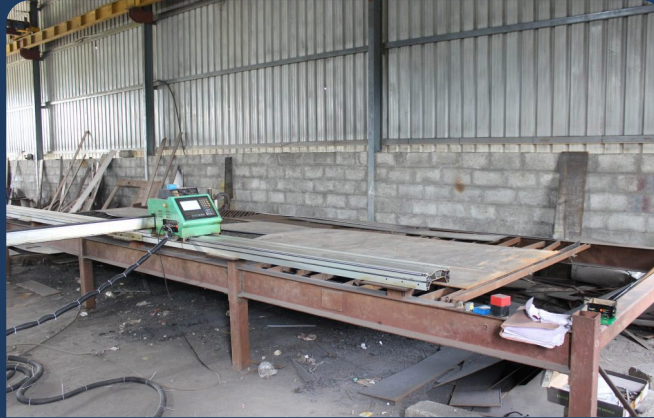
CNC Plasma Cutting Machine

Automated welding for I-beams & built-up sections